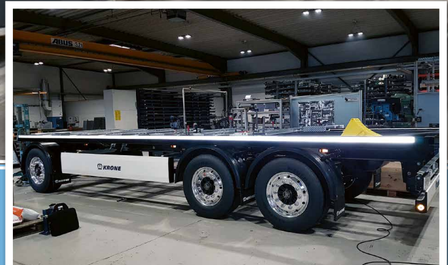
Existing trailer frame to be modified

A safe and secure method of connecting the heavy diesel engine to an existing trailer frame was required.