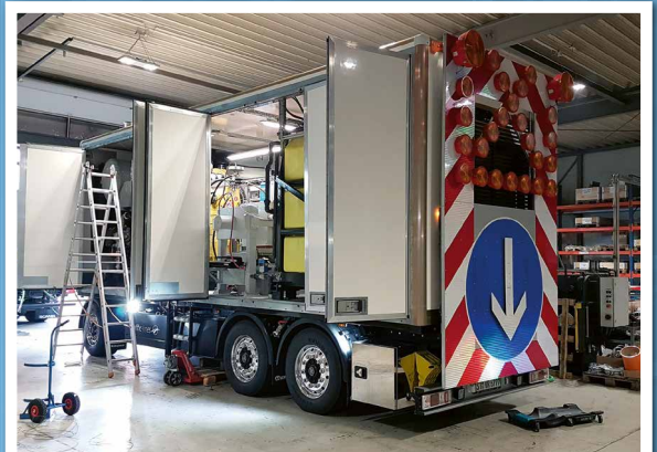
Diesel engine installed on trailer

The connections are approved by the TÜV and in live tests proved they were capable of securing the diesel engine in place during full braking. The first vehicle was successfully delivered to Cologne-Bonn Airport in the summer of 2019.