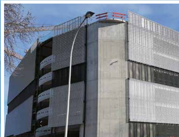
The completed cladding system

The clamps are fully adjustable which gave the contractor the ability during installation to manoeuvre the brackets into their final positions before fully tightening them.