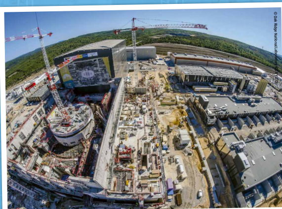
ITER nuclear facility under construction

Hollo-Bolts provided a solution which avoided having to weld, or bolt through the body of the HSS. They also met the IAEA guidelines for nuclear power plant construction, as Hollo-Bolts carry full and independent ICC-ES approval for Seismic Design Categories A through F. Construction is expected to be completed in 2025 when commissioning of the reactor can commence, with full fusion experiments starting in 2035.