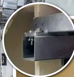
Hollo-Bolts used to connect HSS beams