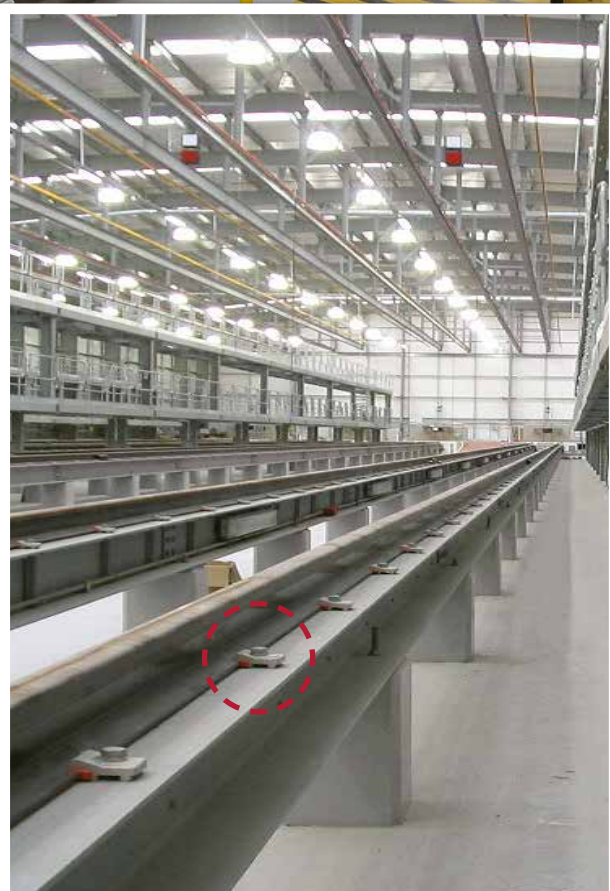
Type HD rail clips used to secure the rails

Running down the length of each side of the bogie drops were reinforced concrete plinths with UKC way beams attached to the top. The challenge was to find a suitable method of connecting flat bottomed rails to the way beams so that trains could safely roll onto them and over the 'bogie drop' area for maintenance.