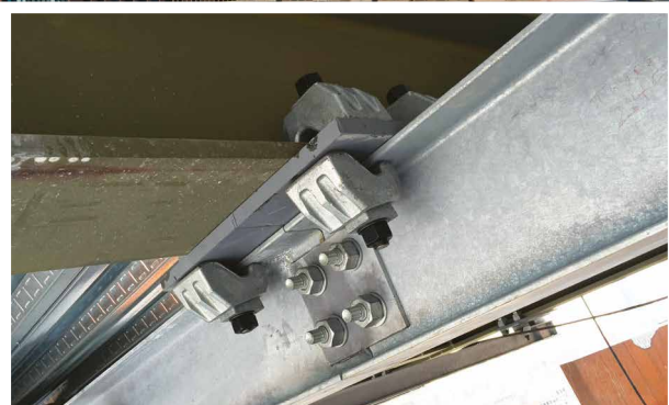
Type AAF girder clamps used in 4-bolt configuration

Due to working at height, a drill and weld-free method of connecting a steel framework to underneath the skybridge trusses was required in order to attach cladding panels.