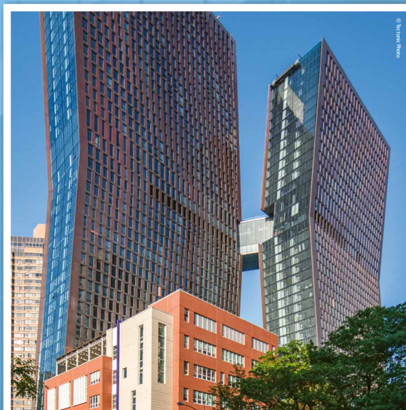
Three storey skybridge links the two towers

Type AAF Girder Clamps provided a drilling and weld free connection that was quick and easy to install whilst working at height. The stunning three storey skybridge now links the two buildings and includes a fitness and leisure complex with a swimming pool on the bottom floor.