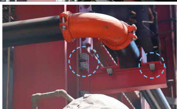
Type AAF girder clamps used in tensile and slip

Another consideration was prevention of any damage to the existing steel structure that would be caused by traditional drilling or welding connections.