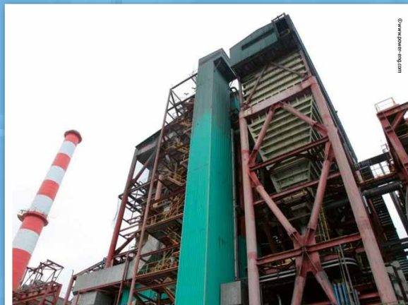
Via del Mar power station during expansion

The girder clamps have independent technical accreditations, including the CE mark (ETA-13/0300), and TÜV approval, in addition the Type AAF has ICC-ES approval. These accreditations verify the load and slip capacities that led to a safe and successful installation.